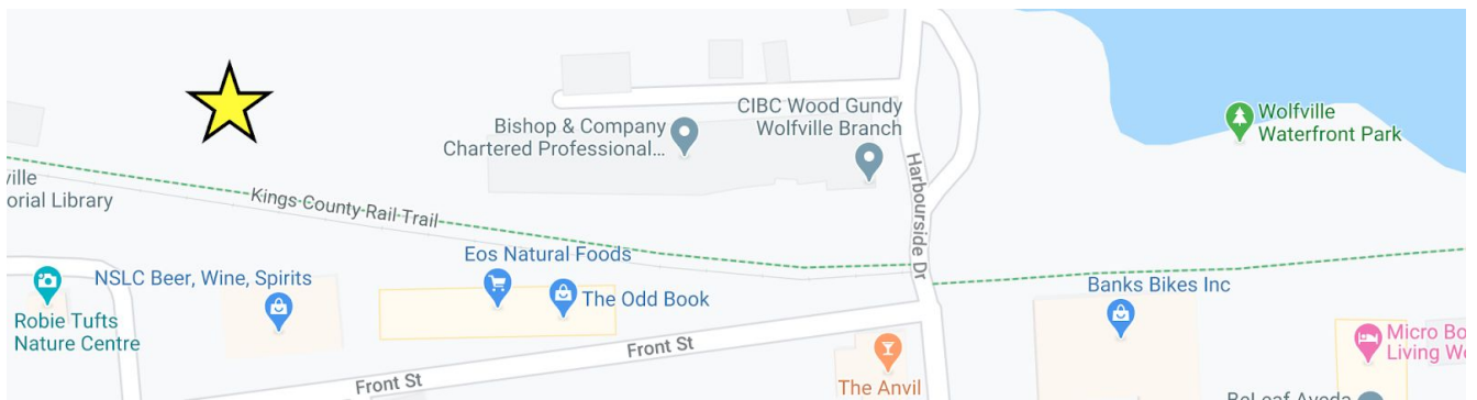
Harbourside Drive (adjacent the Robbie Tufts Nature Centre)

In addition, there are several 24-hr street parking options :