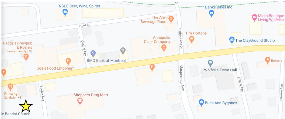
Linden Avenue (off Main Street, behind Subway)